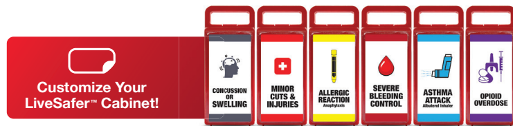
*Let us know which labels you need when ordering.

*No Medication Included - We Sell Empty Cases/Cabinets and You Obtain Your Own Medication